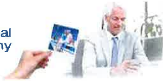
Chart Your Course. We'll help you get there.